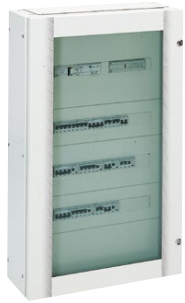
Enclosures depth 260 mm delivered without plinth